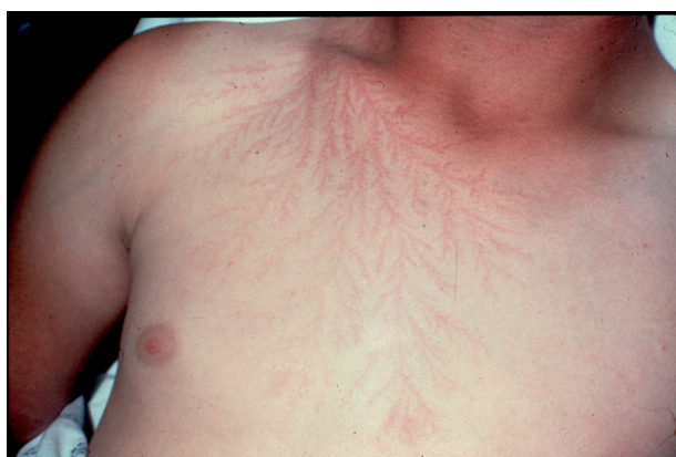
Figure 2. Feathering Burn

(Reprinted by permission from Elsevier. This figure was published in Rosen's Emergency Medicine Concepts and Clinical Practice, Price TG and Cooper MA, Electrical and lightning injuries, 2267-2278, Copyright © Elsevier 2006.)