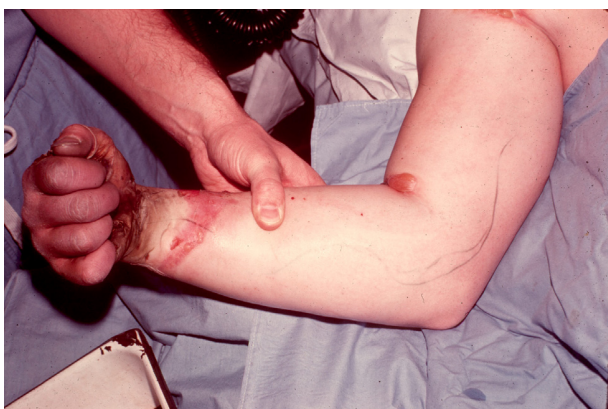
Figure 1. Kissing Burn 3

(Reprinted by permission from Elsevier. This figure was published in Rosen's Emergency Medicine Concepts and Clinical Practice, Price TG and Cooper MA, Electrical and lightning injuries, 2267-2278, Copyright © Elsevier 2006.)